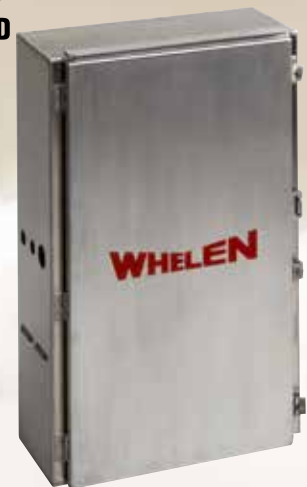
TYPE I Electronic Cabinet